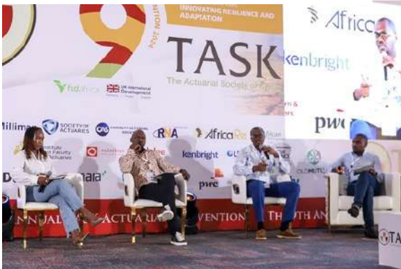
CEO's Panel in progress