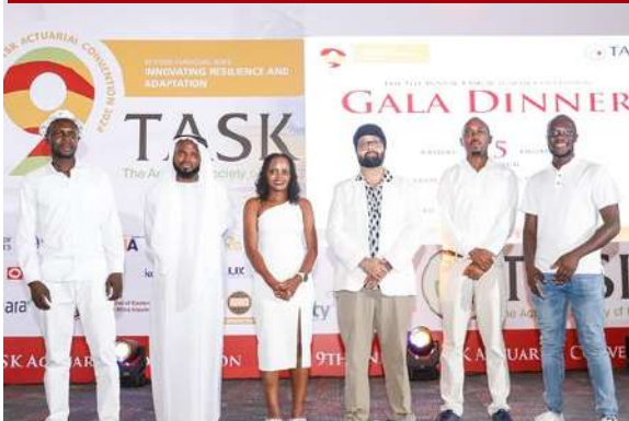
Some Members of the TASK Council 2024/25

Some of the action pictures from the convention